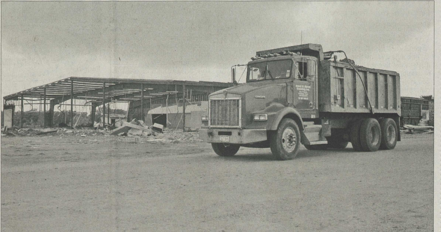
The old motel at the crossroads of 90A and Hwy. 71 is currently being torn down.

Check Us Out Online at: www.eaglelakeheadlight.com